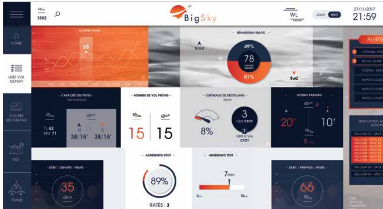
Dashboard: a modern and functional HMI offering better situational awareness.

Live trials took place at Paris-CDG in March 2018. BigSky implementation with first functionalities is scheduled before summer.