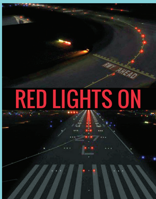
RED ON - I STOP RUNWAY IS ENGAGED STOP AND WAIT FOR ATC CLEARANCE