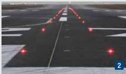
Take-off Hold Lights (THLs) Illuminated red THLs mean STOP! The runway is unsafe for take-off.