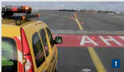
Runway Entrance Lights (RELS) Illuminated RELs mean STOP! The runway is unsafe to enter or cross.

it provides crews and vehicle drivers with immediate, accurate and clear indications when the runway is unsafe to cross, enter or take-off. Its implementation on the field consists of 2 types of lights 1 2 .